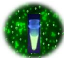
Fig.1 BcMag™ Terbium Fluorescence Magnetic Beads

BcMag™ NHS-activated Terbium Fluorescence Magnetic Beads (Fig.1) are Time-Resolved Fluorescence (TRF) magnetic microspheres coated with high-density NHS (N-hydroxyl succinimide) functional groups on the surface. The magnetic resin utilizes reliable NHS-ester chemistry and does not require the use of dangerous chemicals for immobilization. The beads have less nonspecific binding and no leaking of the coupled ligand. The resin can quickly, efficiently, and covalently conjugate any primary amine-containing ligands by forming stable amide linkages with better than 85% coupling efficiency. The NHS-Activated beads reactions take less than an hour (15–30 min at room temp pH 7–9, 4 hours at 4 °C) and produce substantially more stable linkages.